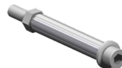
MLBS-BR125 4P CO

For bridging power terminals on the top or bottom side of the switch, one reference code includes complete set of 4 pcs