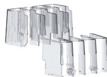
MLBS-TSIN 4P CO

IP2X protection against direct contact with terminals or connecting parts. Under one reference code 2 pcs are included for source or for load side