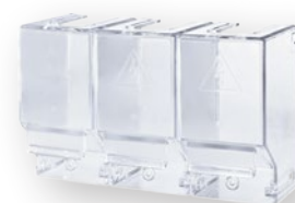
LBS-TS250 3P CO

To fully shroud: front, rear, top and bottom, 4 pcs shall be ordered. To shroud front top and bottom, 2 pcs shall be ordered.