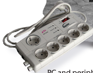
PC and peripheral appliances e.g. monitors, printers, optical readers, CD-drivers or amplifiers; Tv set, video cassette recorder, DVD recorder, TV inlet or your computer: ETITEC COMB ZES-7 TEL-TV ETITEC COMB ZES 1M+5S