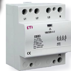
Main distribution panel (power entry); TNS system (SPD cordination), SPD class I/B ETITEC WENT TNCS ETITEC B 4x