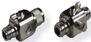
CAMERA: ETITEC COMB 200 PS ETITEC COAX BNC