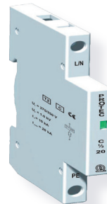
BRANCH SUB-DISTRIBUTION BOARD ETITEC C ETITEC C (3+0, 4+0, 3+1) ETITEC C 1/2