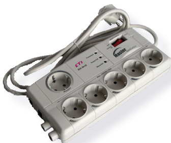
TV - STEREO - DVD ETITEC COMB ZES-7 TEL-TV ETITEC COMB ZES 1M+5S