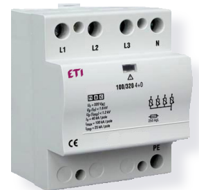
MAIN DISTRIBUTION BOARD ETITEC WENT TNCS, TNC, TT, IT ETITEC B ETITEC B (3+0, 4+0, 3+1)