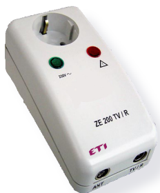
COMPUTER - NET: ETITEC COMB 200 PS ETITEC COMB 200 NET ETITEC COMB 200 FAX/TEL