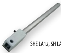
SHE LA12, SH LA345