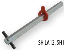
SH LA12, SH LA345