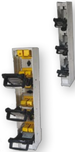
General table of NV strip type fuse-switch-disconnector-single-pole switching-in