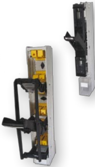
General table of NV strip type fuse-switch-disconnector-three-pole switching-in